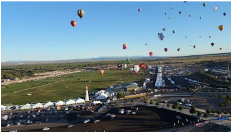
South of the field