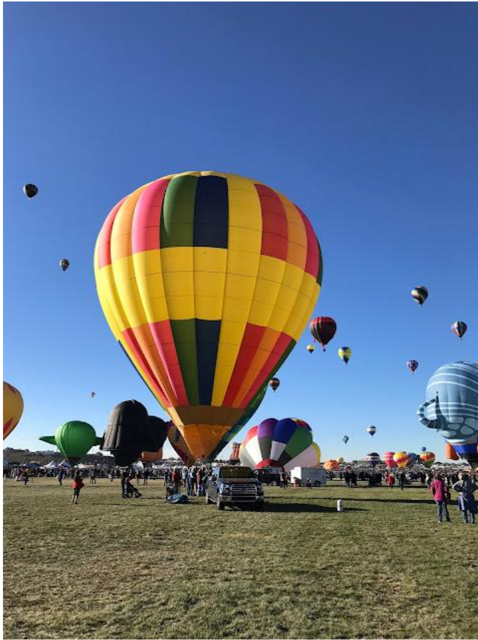
Breezy Rider - Static Display