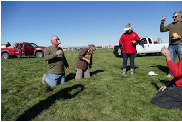
They were able to drink it...