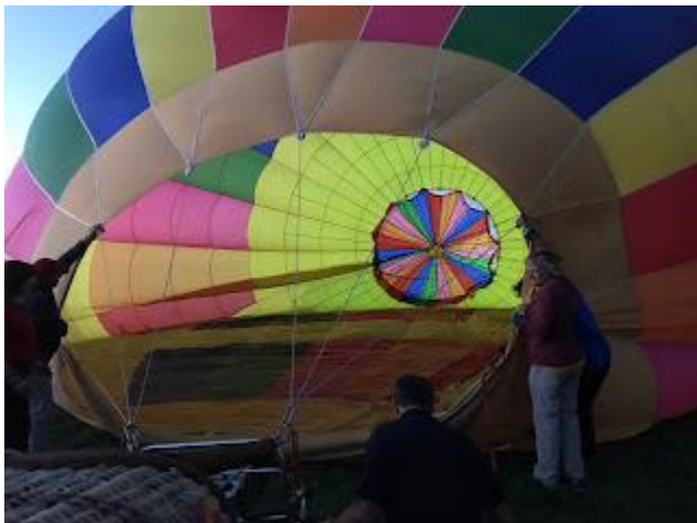
Inflation of Breezy Rider

One of those days. I was to take Michelle on her fist flight. The day was warm. We pulled out the balloon and tried to inflate it. Somehow the top popped out and we terminated the inflation so I would not burn the balloon. Later the Zebras let me bring it up as a static display.