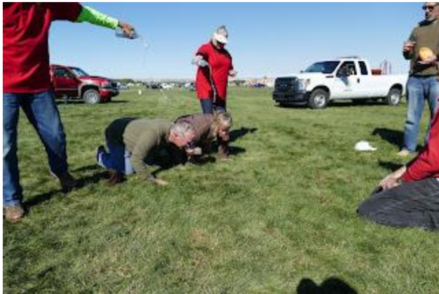
We pour water of the new assigners as we are to cheap to pour champagne