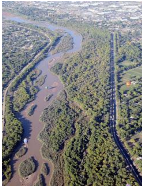
Crossing the river