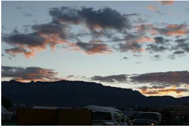
Sunrise (looking East)