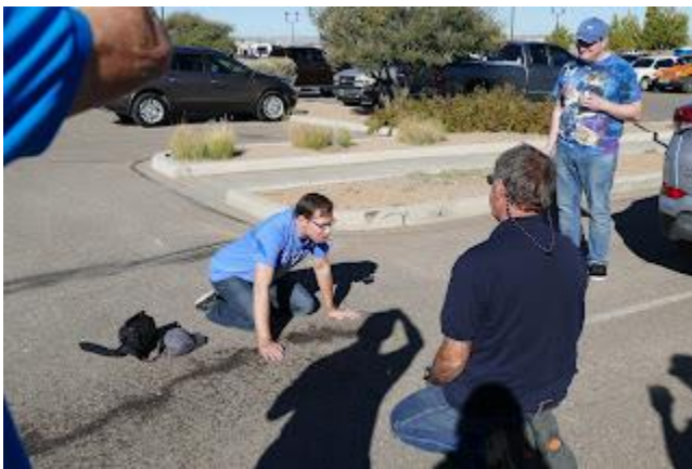
How to drink champagne without your hands