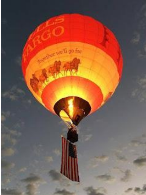
Showing the American Flag