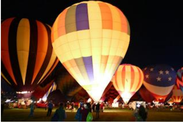
Breezy Rider Glowing