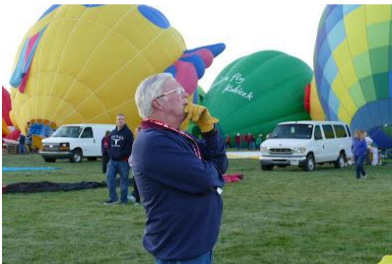
Watching the wind pattern before launch...