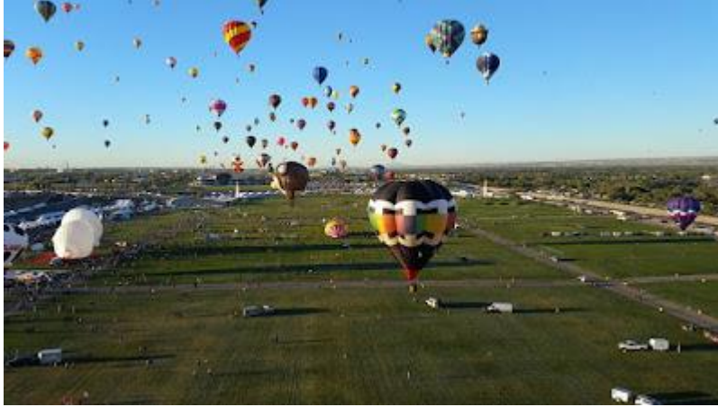
Just after launch