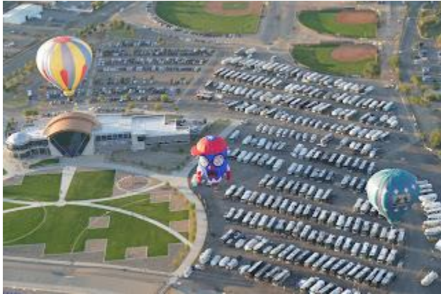
The balloon museum