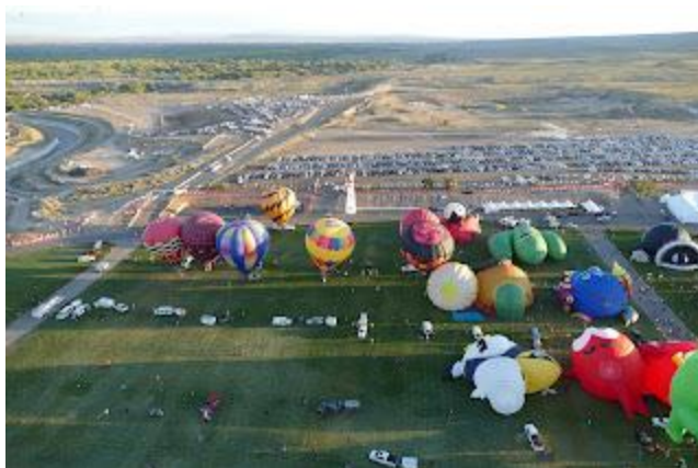
As we made the turn from heading South to Northwest we could see Kathy getting ready to launch